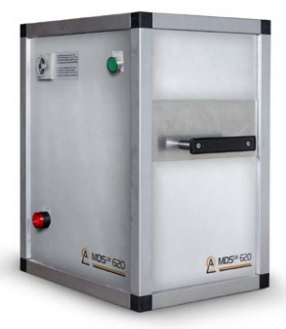
AL SYSTEMS - MDS-UV-620 MANUAL DECONTAMINIATION SYSTEM

AL SYSTEMS - MDS-UV-420R MANUAL HIGH-VOLUME DECONTAMINIATION SYSTEM